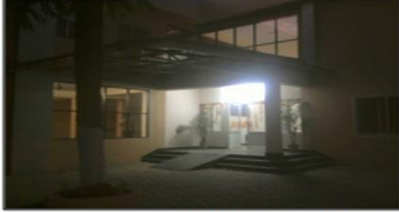
* Reference Image

Bidders are requested to visit the site to appraise them about the infrastructure available.